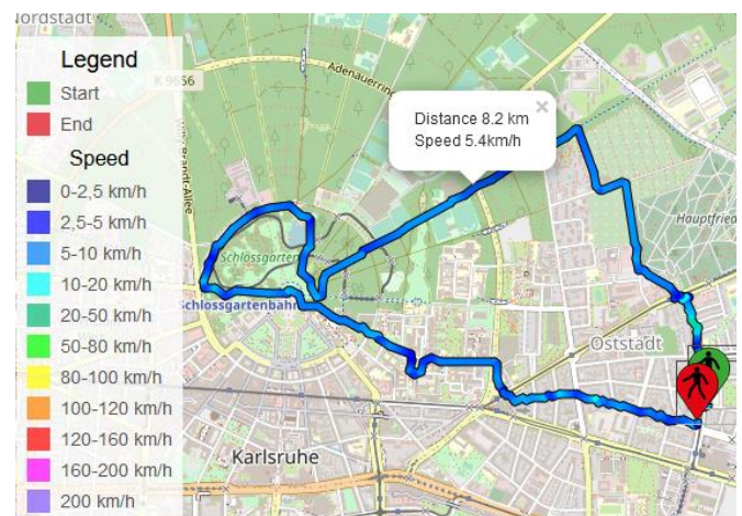
Figure 3: Example of a pedestrian track where the speed is visualized in different colors and the distance and average speed can be viewed in a popup

The result for a recorded walk can be seen in figure 3.