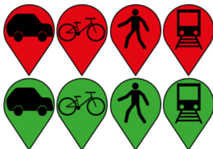
Figure 1: Icons for the different means of transport

Afterwards, the GPX-Tracks were imported into a leaflet map using the plugin Leaflet GPX . The differentiation between the different means of transport is visualized by using different start and end icons (Figure 1).